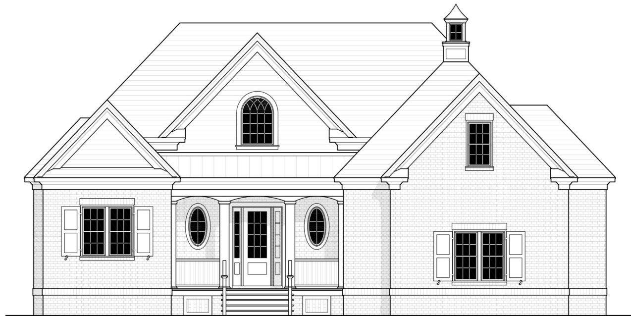
FRONT ELEVATION - TRADITIONAL BRICK