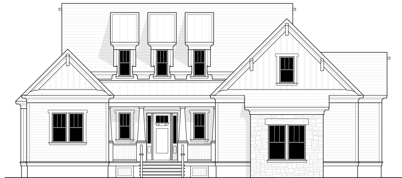
FRONT ELEVATION - CRAFTSMAN STYLE